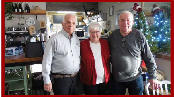
Our Farm-A-Go-Go Hosts...